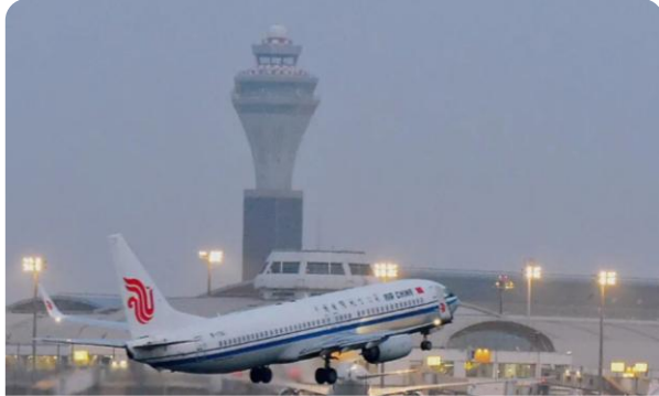
Beijing Capital International Airport