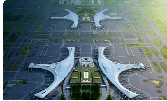
Chengdu Tianfu International Airport