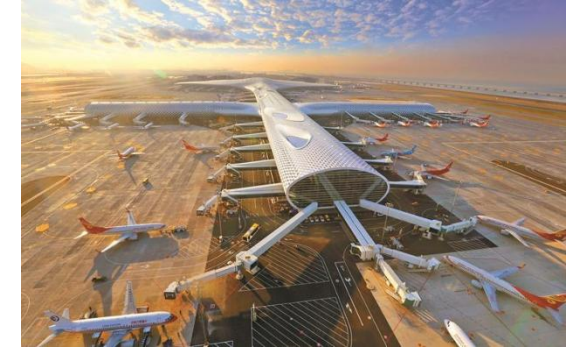
Shenzhen Bao'an International Airport