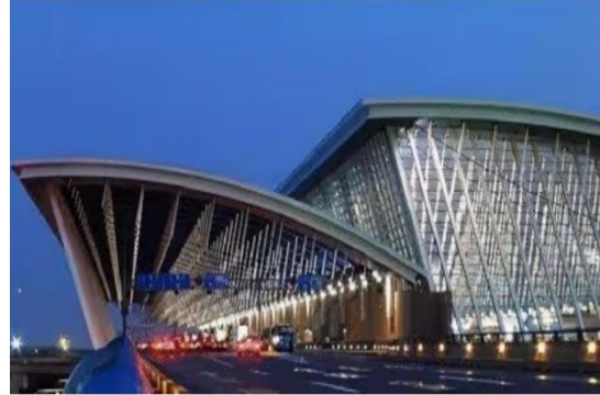
Shanghai Pudong International Airport